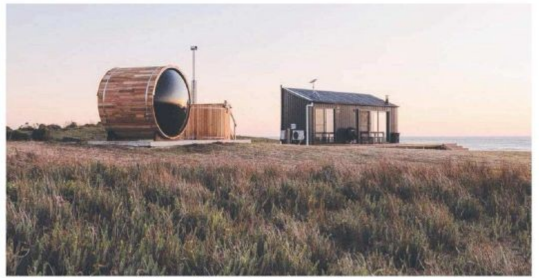
Self-Contained Accommodation award - Red Rock Hut, King Island.

Our tourism champions celebrated at industry's gala night