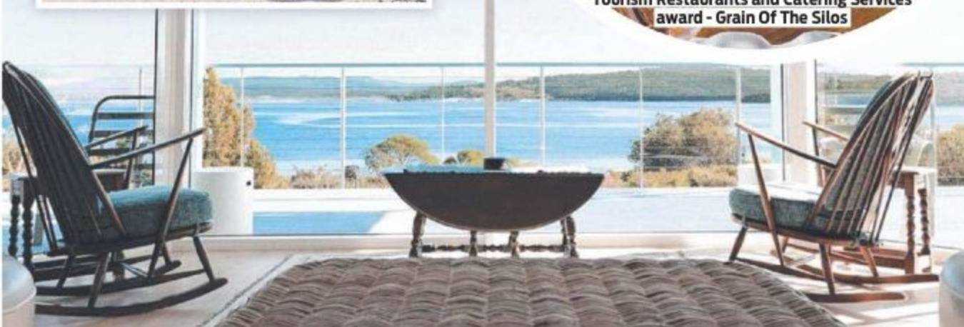
Tourism Retail, Hire and Services award – Younique Stays.