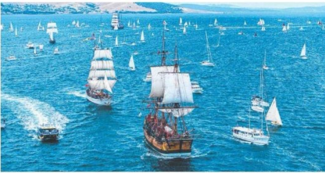
Major Festivals and Events, and People's Choice awards - Australian Wooden Boat Festival.