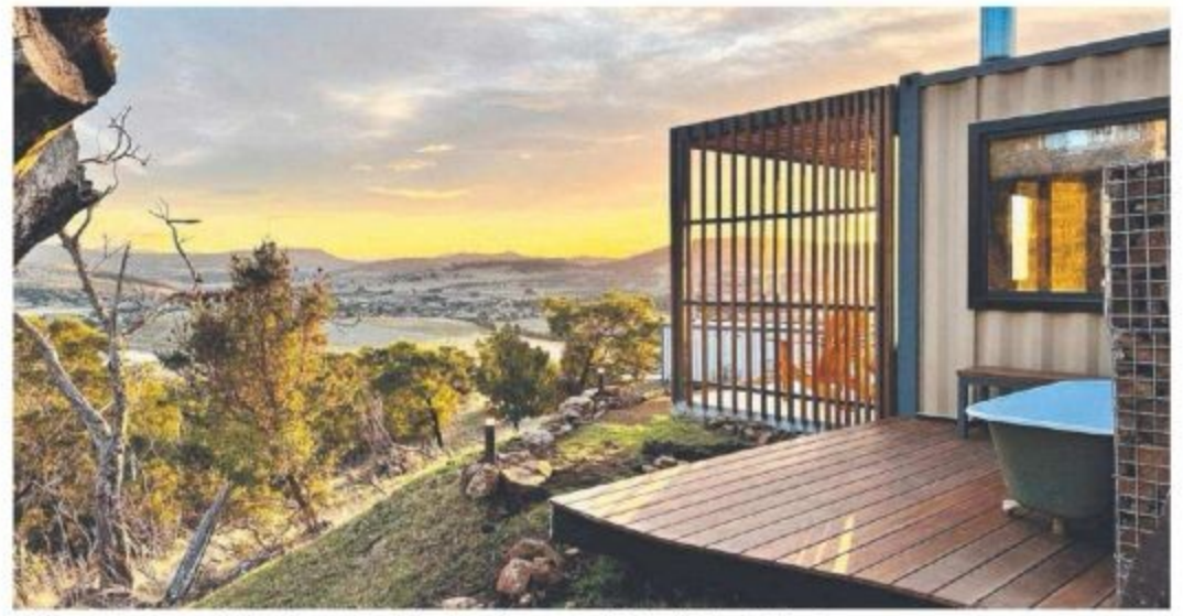
Unique Accommodation Award and Ecotourism award - Aquila Eco Retreat