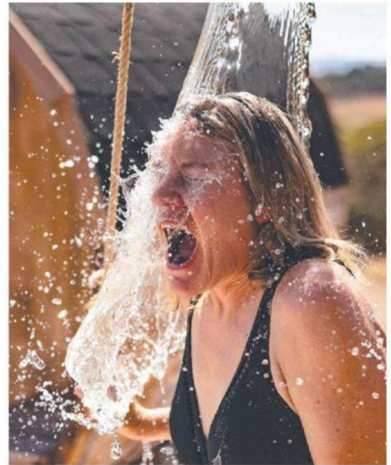
Unique Accommodation and Ecotourism awards- Aquila Eco Retreat.