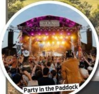
Party in the Paddock

Showcasing the best our state has to offer