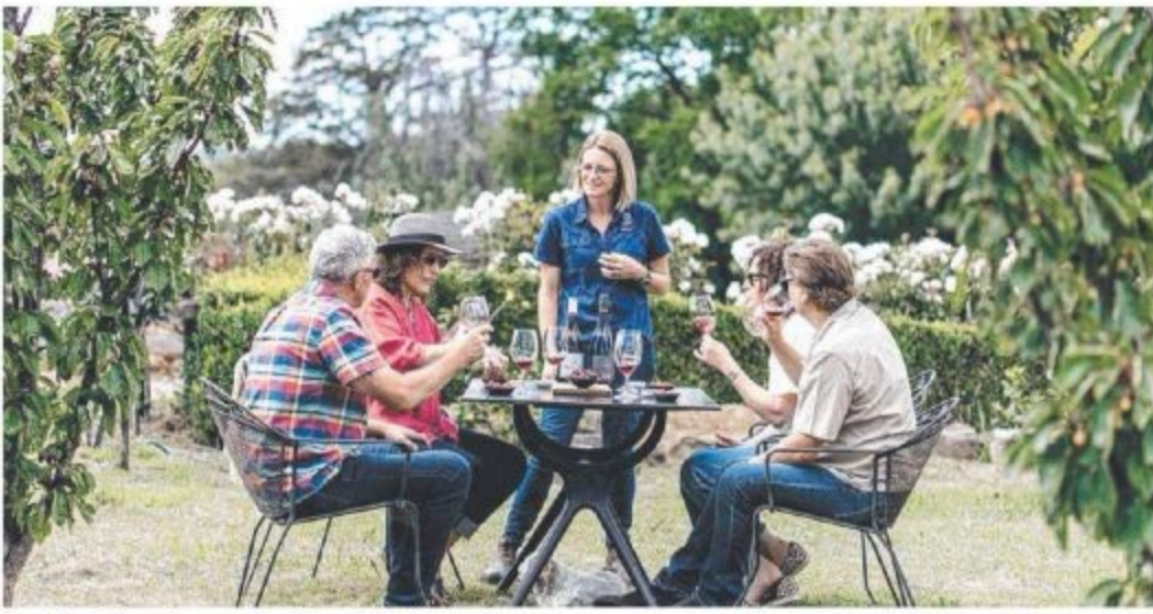
Tourism Wineries award - Holm Oak Vineyards