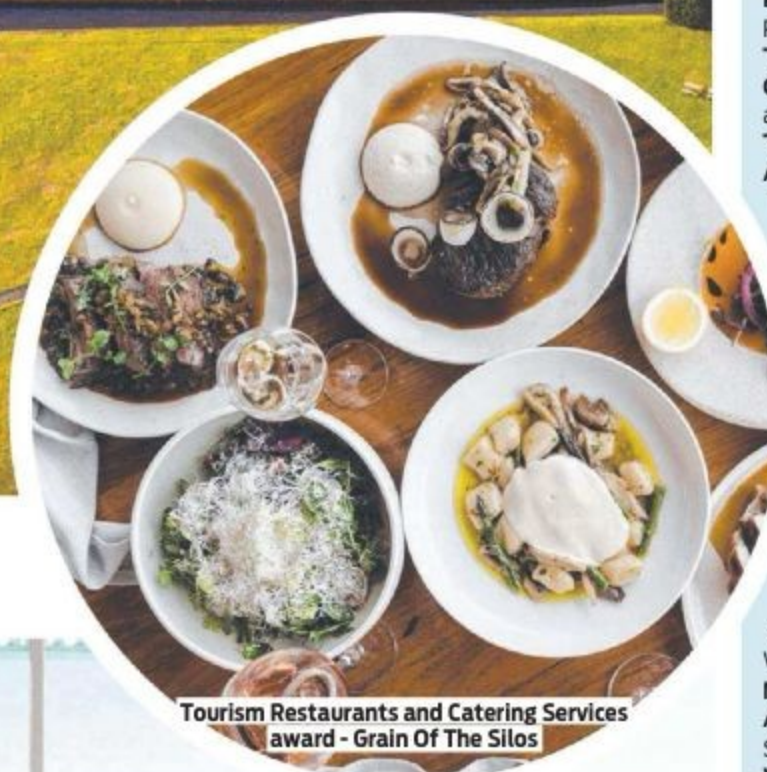
Tourism Restaurants and Catering Services award - Grain Of The Silos