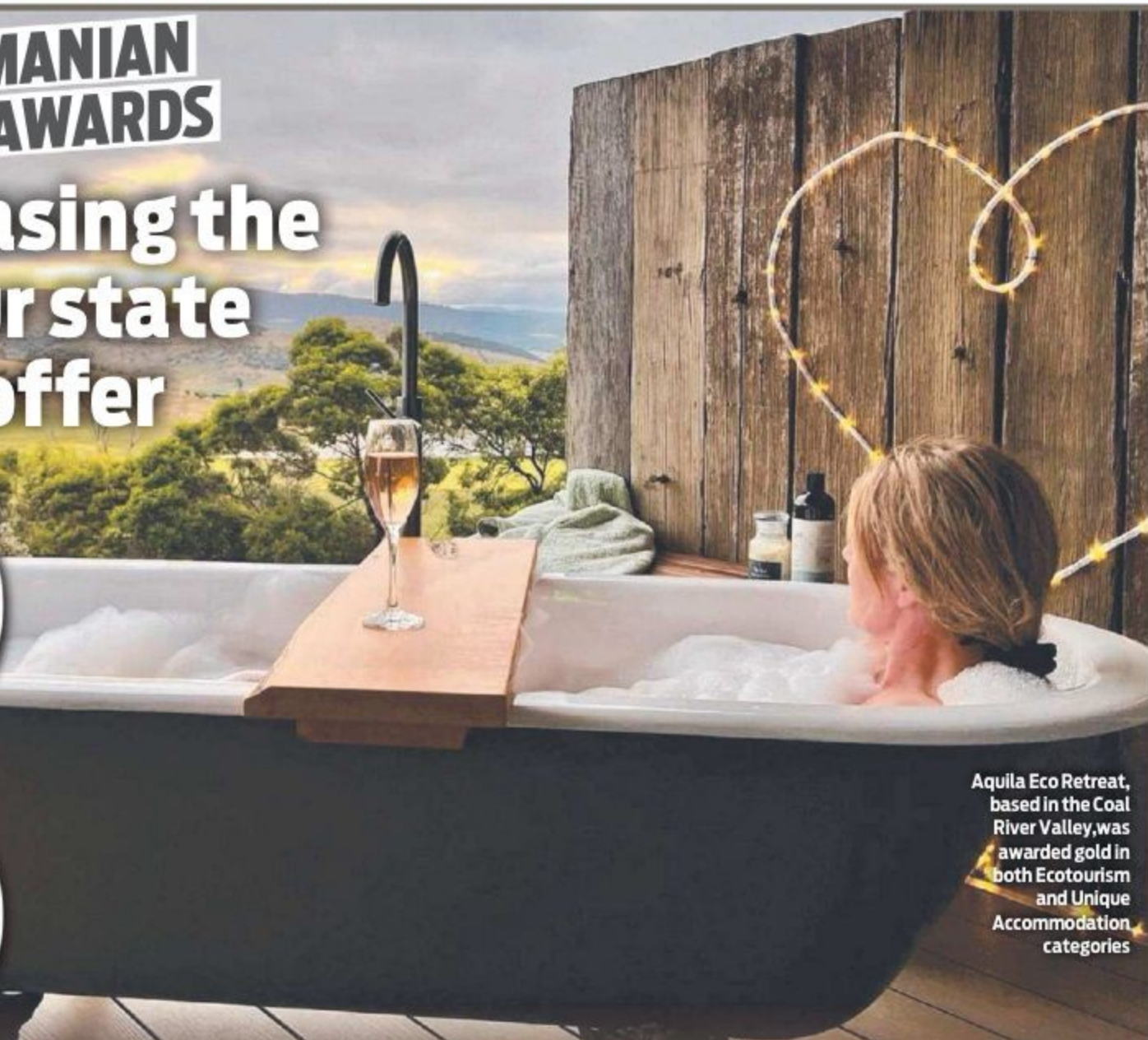
Aquila Eco Retreat, based in the Coal River Valley, was awarded gold in both Ecotourism and Unique Accommodation categories